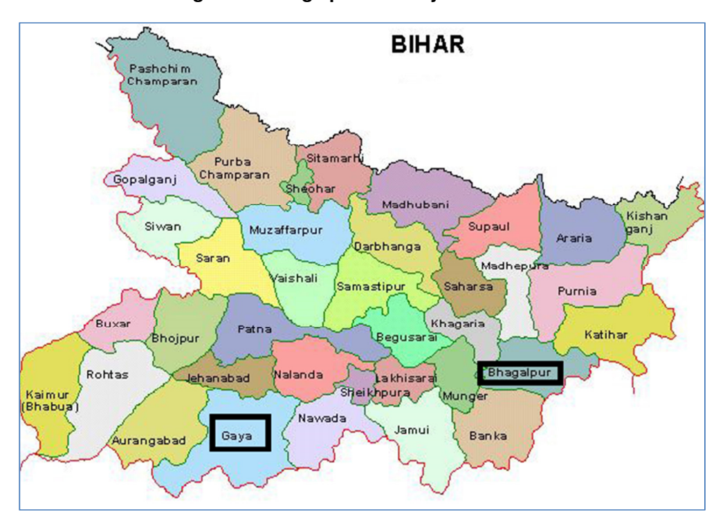
Figure 1 Bhagalpur and Gaya towns in Bihar